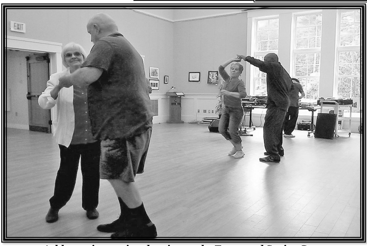
Ashby seniors swing dancing at the Townsend Senior Center.

Special thanks to DS Graphics for generously printing this month's COA Senior Scoop newsletter advertisement free!